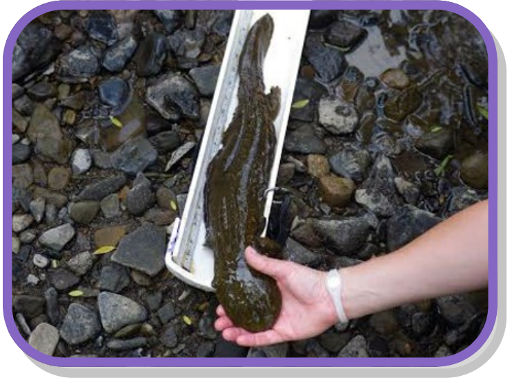
Above: Photo of an Eastern Hellbender. Hellbenders are sensitive to sediment pollution in streams. They are a good indicator of stream health.

Over 50 guests attended the workshop, located at the Elk Country Visitor Center in the new Outdoor Classroom. Funding for this workshop was provided by a PACD Mini Grant.