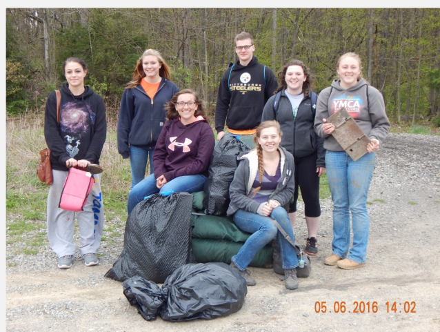
The Saint Marys Ecology Club poses for a photo with the trash they collected at the West Creek Wetlands.